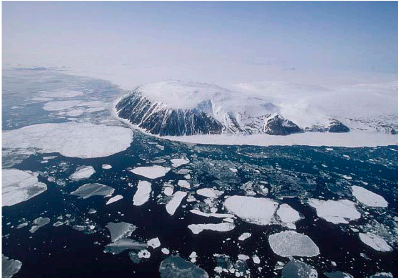
Photo #3: Diomedes Island in the Bering Sea. The proposed Bering Strait Rail Tunnel will pass through both Little Diomedes (United States) and Big Diomedes (Russia).

Trip of a lifetime: The Kremlin has given the green light for a £60-billion tunnel linking Siberia to Alaska through the Bering Strait.