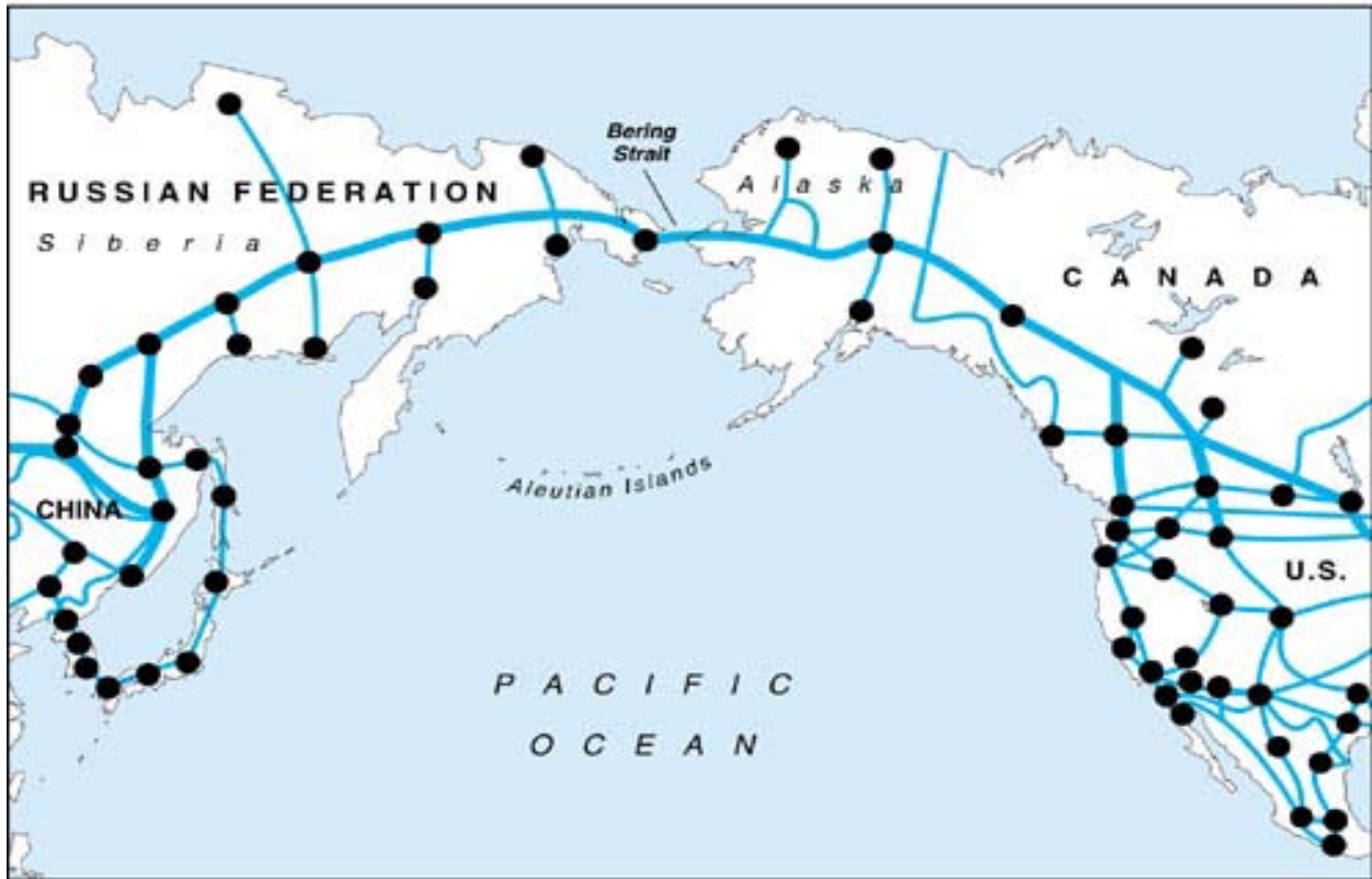
Illustration 2. Plan For A Tunnel Connection Under The Bering Strait Between Siberia And Alaska.

A graphic illustration of the expansive network of potential economic impact of the Bering Strait Tunnel. This illustration only covers the west coast of Canada, America, and Mexico and the east coast of Russian Siberia and eastern China and Japan.