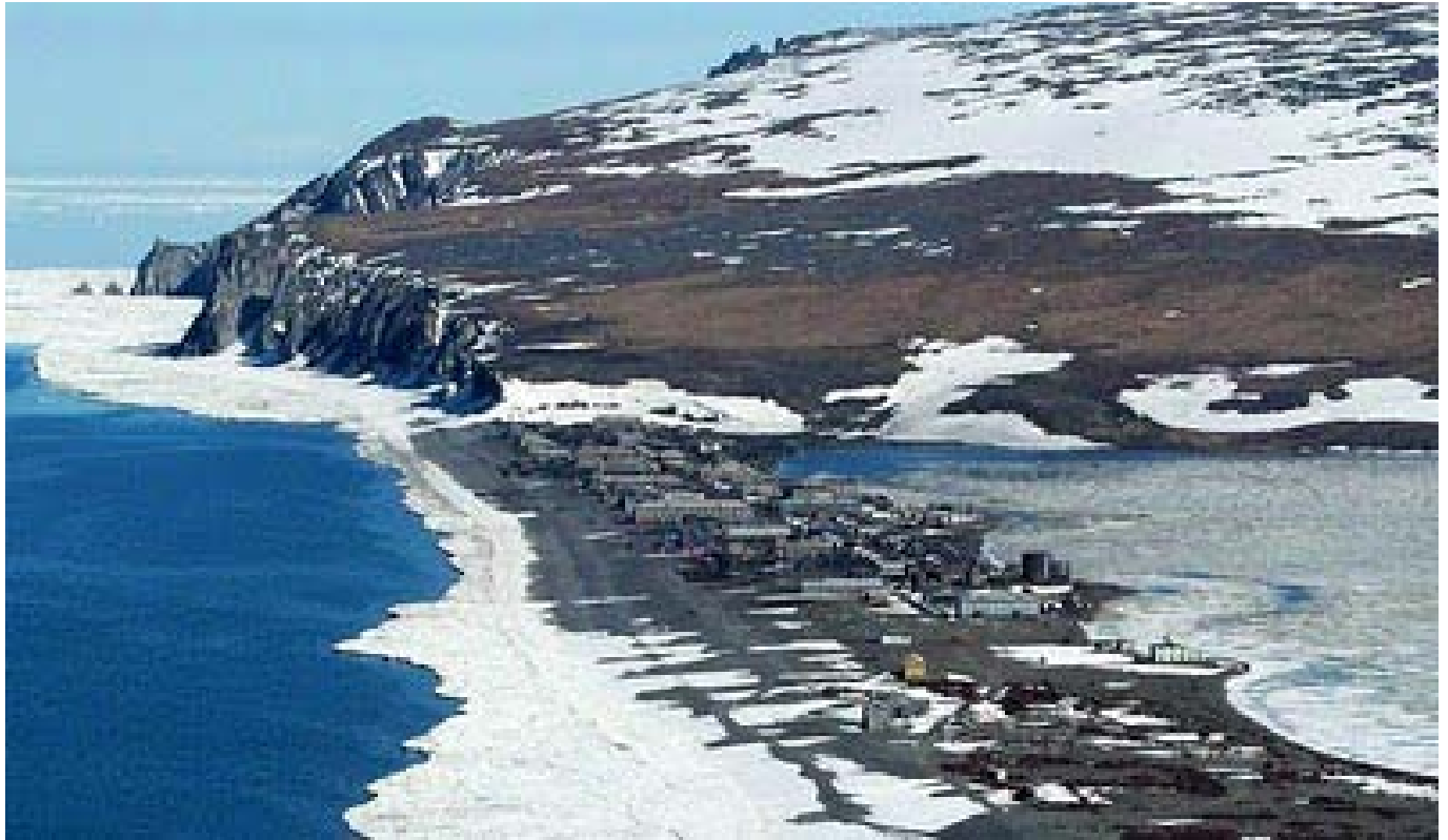
Photo #4: Located where the Bering Sea meets the Chukchi sea, Uelen is the easternmost settlement in Russia and all Eurasia. Uelen also is also the closest Russian settlement to the U.S.