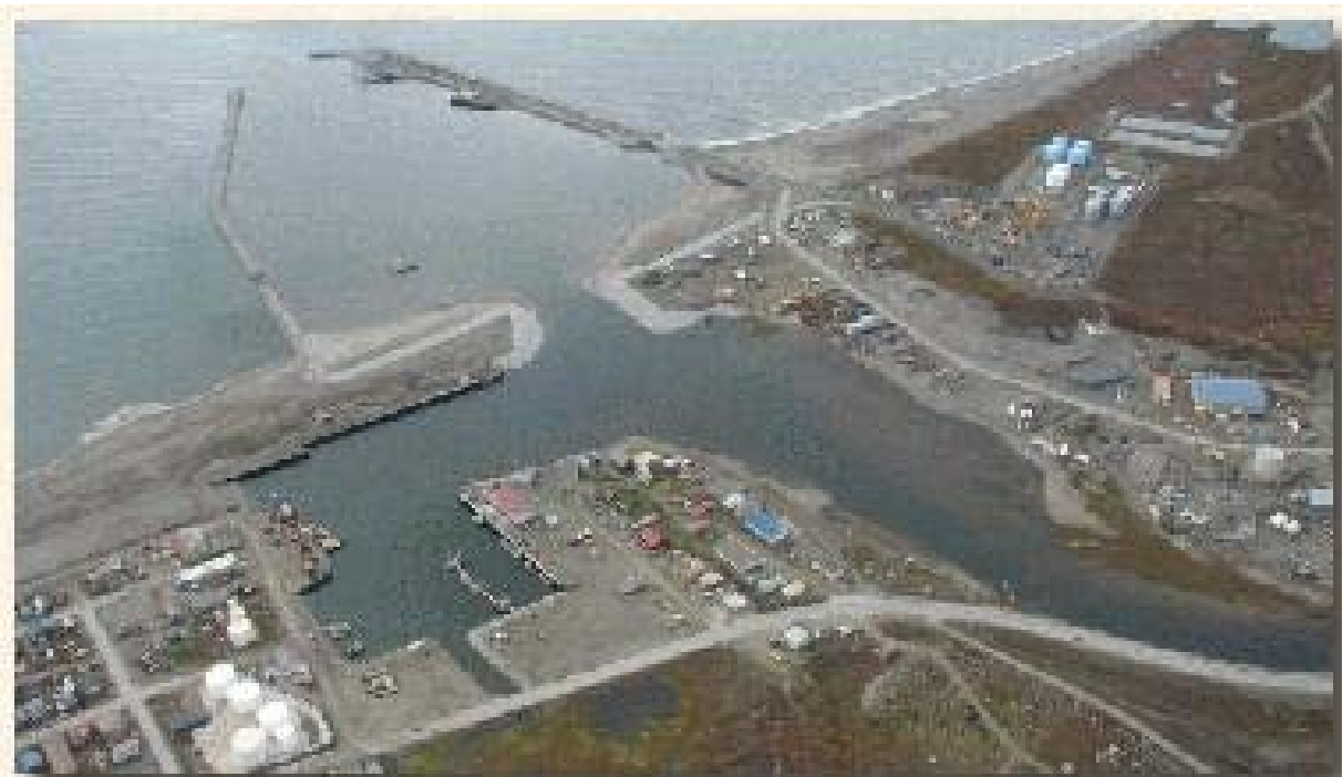
Photo 1. The Small Boat Harbor at Nome.

rescue of ships; towing stranded ships out of harm's way; transferring cargo from the western United States and western Canada brought in by train, for shipment through the Arctic Ocean or the Pacific Ocean, from and to Europe and Asia. The efficiency of shipping over the Arctic routes would be greatly increased if turnaround could be accomplished at Port Clarence, for example. Freight from Europe bound for the Northwest of the United States or Canada could be shipped by rail from the Port Clarence harbor. Freight from the Northwest of Canada and the United States mainland could be shipped by rail for trans-shipment by ship through the Arctic Ocean.