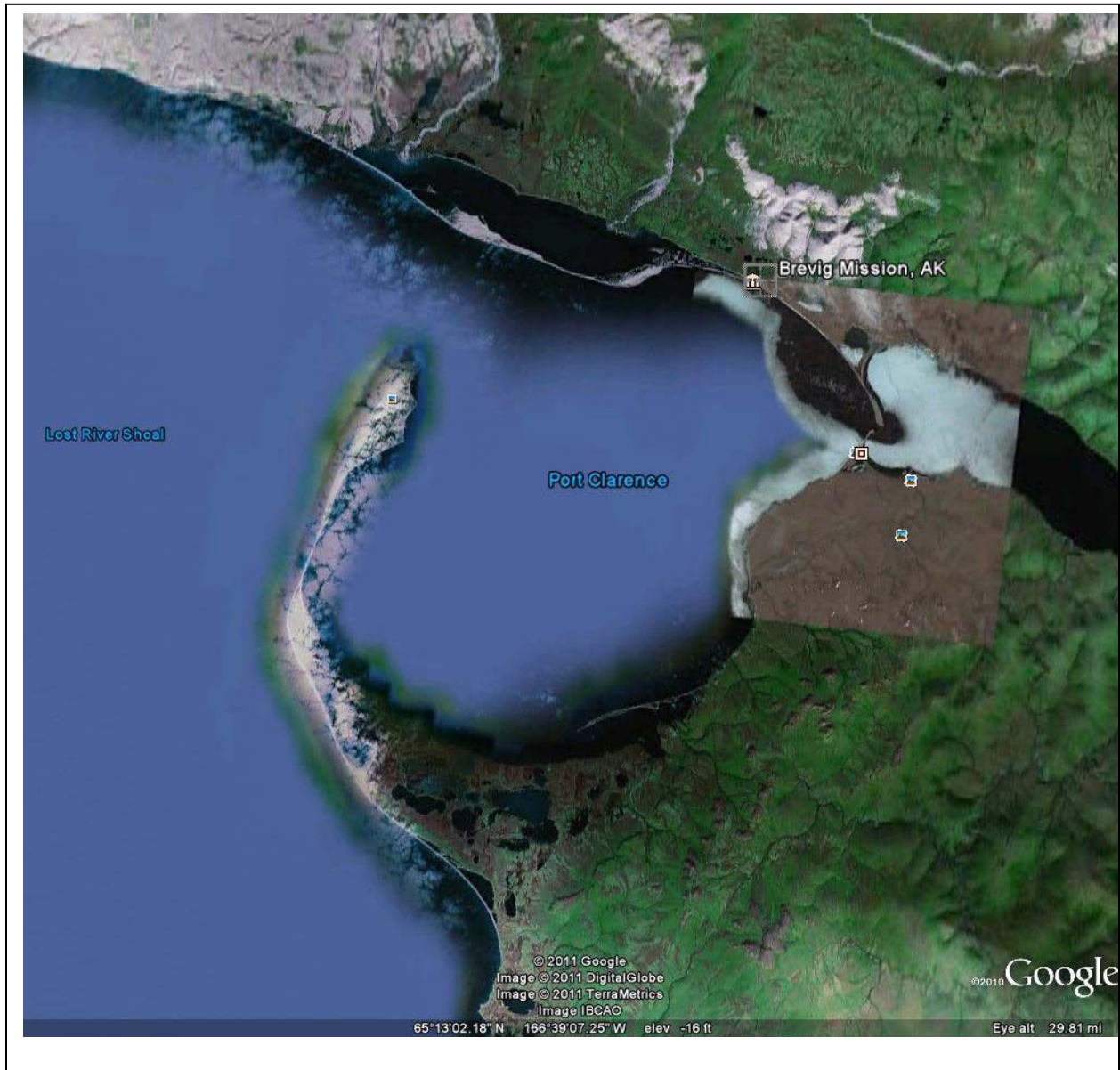
Photo 2. Port Clarence and the Villages of Brevig Mission and Teller.

Port Clarence, and the villages of Teller and Brevig Mission. A protected harbor with access from the Bering Sea. The village of Teller is located just below the passage into Grantley Harbor. Port Clarence has a depth of around 6 to 7 fathoms which should be able to accommodate a 12.5 meter (42 feet) draft vessel. A rail freight terminal at Port Clarence would allow ships to load cargo and expedite transit through the Arctic routes during the main shipping season, April to October.