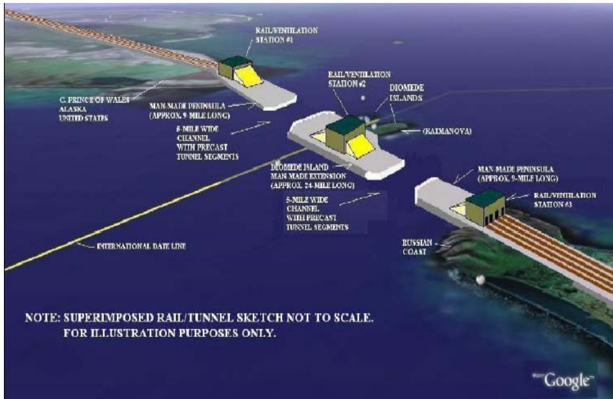
Illustration 1. Superimposed Railroad Tunnel Sketch (Not To Scale)

Conceptual schematic of the proposed Quadrail tunnel under the Bering Strait from Siberia to Alaska. The 64-mile tunnel would run from Cape Prince Wales on the Seward Peninsula in Alaska (top left) under the Bering Strait to Cape Deshnev on the Chukotka Peninsula in Russia. This tunnel would be twice as long as the 34-mile English Channel Tunnel.